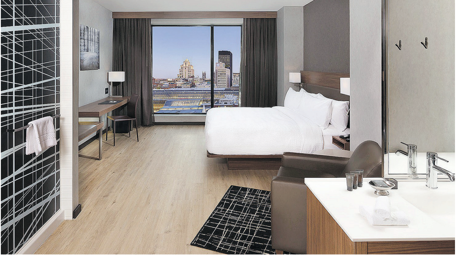
The new AC Marriott Montréal Centre-Ville features spacious guest rooms and suites.